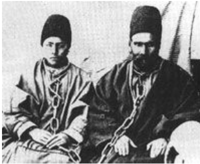
Varqá, son and father in chains

In the summer of 1969, some youth in Texas arose to take the Message of Baha'u'llah from city to city. Touched by the spirit of love and sacrifice of their spiritual forefathers in Iran, they followed their example of detachment and went teaching.