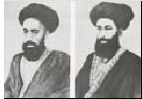
King of Martyrs (left), and Beloved of Martyrs (right). Two brothers

The Texan youth were reading how twelve-year old Rouhullah Varqá and his father gave their lives, Badi sacrificed himself for the Beloved, or the brothers known as the King of Martyrs and the Beloved of Martyrs, were martyred. The older brother was Mírzá Muhammad-Husayn, given the title Mahbúbu'sh-Shuhadá' (Beloved of Martyrs). His brother was Mírzá Muhammad-Hasan, given the title Sultánu'sh-Shuhada' (King of Martyrs). The latter was identified as one of the nineteen Apostles of Bahá'u'lláh.