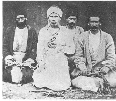
Badi in chain